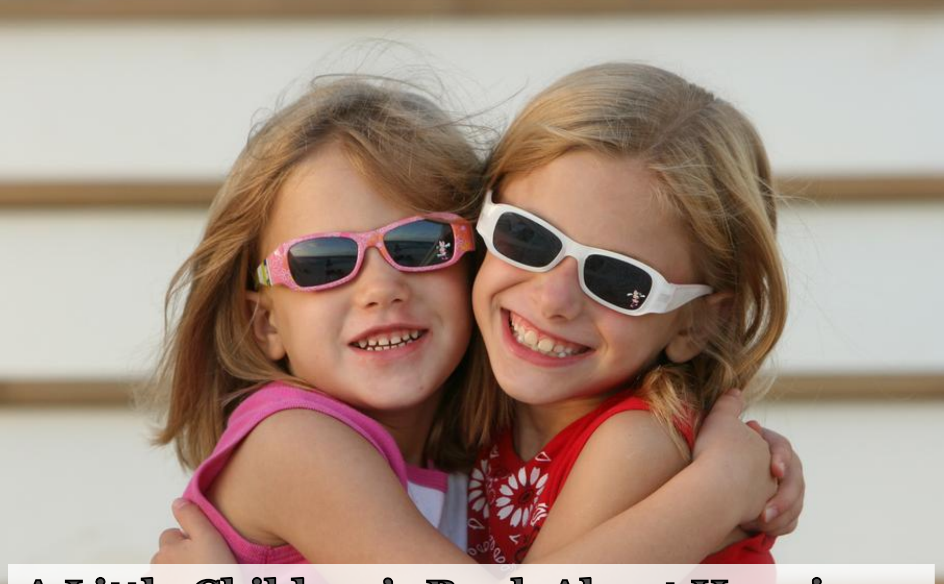
A Little Children's Book About Happiness 小儿童的书: 幸福