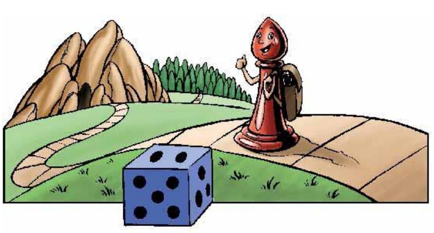
Presentation by <a href="https://www.freekidstories.org">www.freekidstories.org</a>. Text courtesy of Activated magazine; used by permission. Art © TFI.

While you may enter this new year not completely sure of what it will bring and what you'll need to see you through it, strive to move along at the pace I set for you. There's so much ahead, but the path may only open up to you one roll at a time. So you've got to take it as it comes, gain the most you can out of each turn, and remember to stay close to Me.