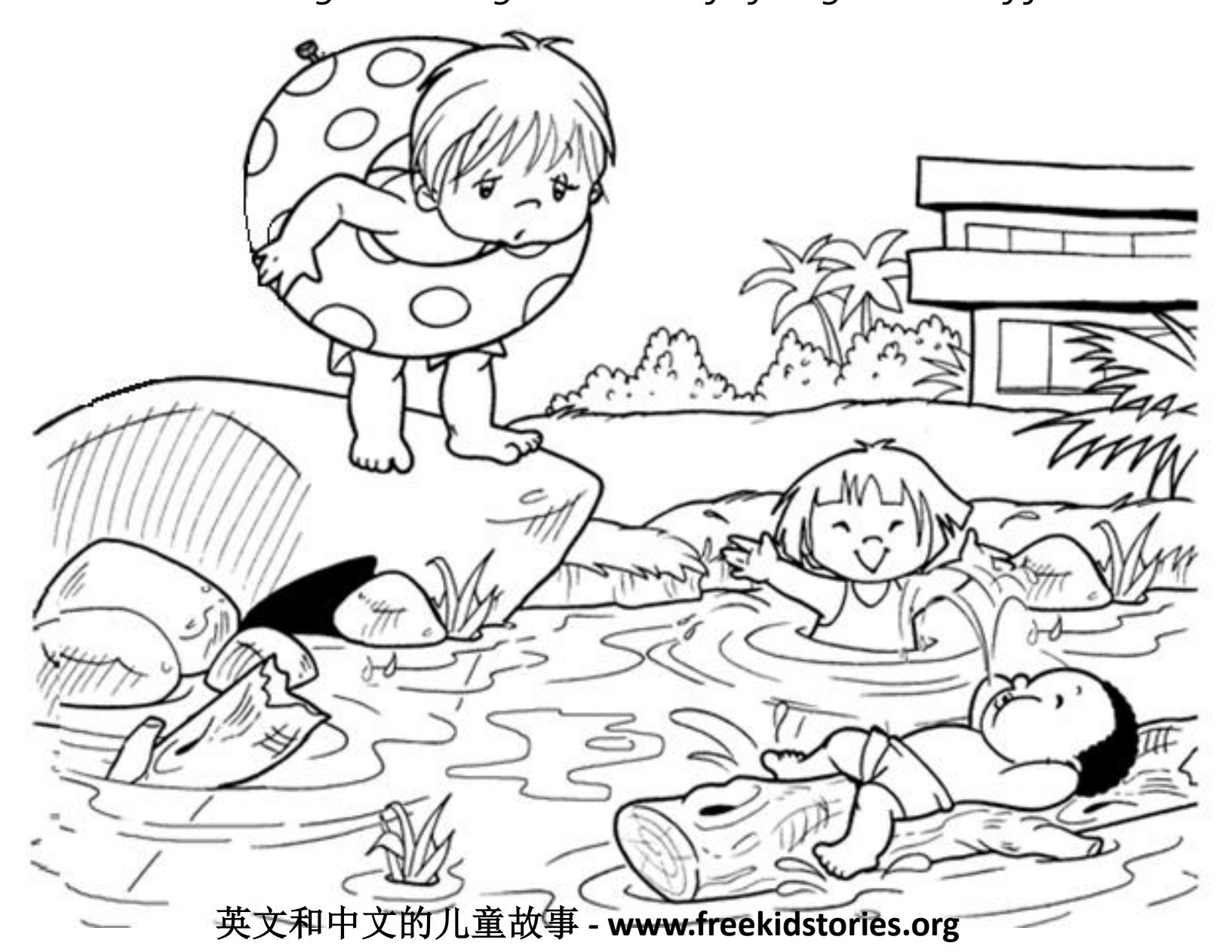
寓意:学习新事物是一种令人满足及有趣的事。 Moral: Learning something new can be fulfilling and lots of fun!